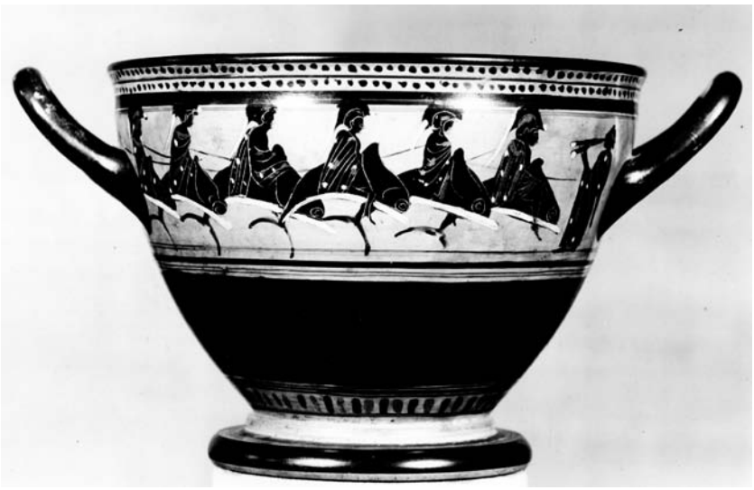
Fig. 4a. The Boston Ostrich/Dolphin Riders : dolphin side; Fig. 4b. The Boston Ostrich/Dolphin Riders : ostrich side (Attic black-figure skyphos, ca. 500–490, ABV 617, Green 1985, nr. 17, fig. 20a–b). Boston Museum of Fine Arts 20.18.