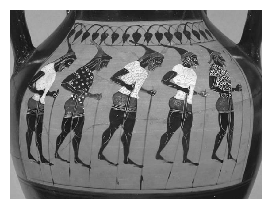
Fig. 3. The Christchurch Stiltwalkers (Attic black-figure amphora by the Swing Painter, Para. 134, 31 bis, Addenda . 81, Green 1985, nr. 4, fig. 7; Cohen and Shapiro 1995, 7–8). Christchurch, New Zealand, James Logie Memorial Collection, University of Canterbury 41/57.

to the point.<sup>38</sup> It shows on each side six riders, with long cloaks and carrying spears, but now on real animals. On one side (fig. 4a) they ride dolphins and wear helmets, and on the other (fig. 4b) they ride ostriches (whose long legs resemble the stilts of the Christchurch figures, while their rounded backs resemble the dolphins on the reverse of the same vase). A nearly identical piper plays facing the riders on each side, but facing the ostrich riders there is an additional figure, a bearded cloaked