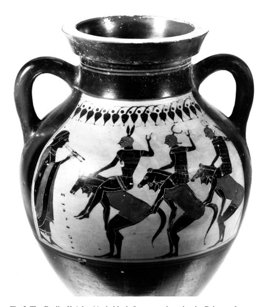
Fig. 2. The Berlin Knights (Attic black-figure amphora by the Painter of Berlin 1686, ABV 297, 17; Para. 128, Addenda 78, Green 1985, nr. 3, fig. 6). Antikensammlung, Staatliche Museen zu Berlin-Preussischer Kulturbesitz, F 1697.