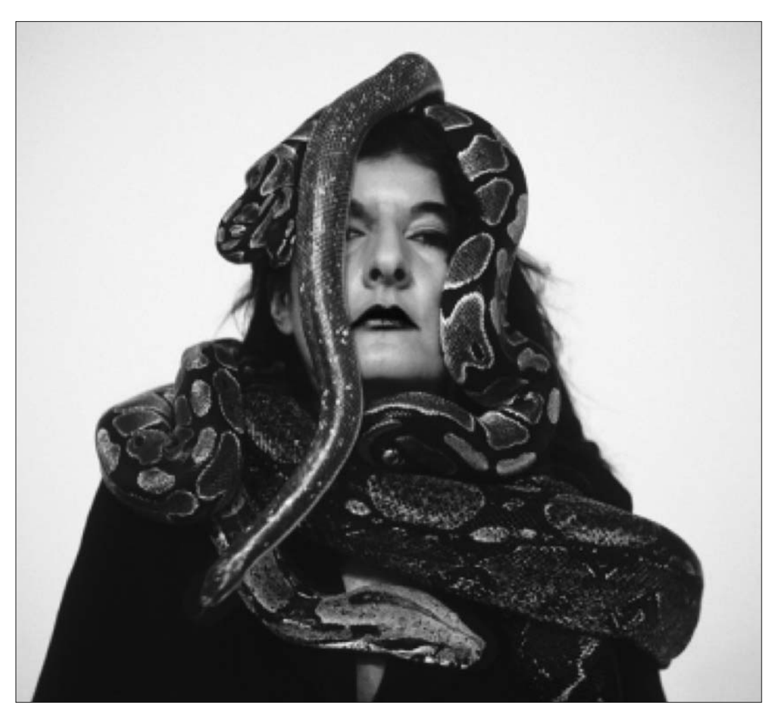
Above and opposite page: Marina Abramović performing in Dragon Heads .

prior to the show, are now allowed to slither around her body. The female body is surrounded by ice cores whose prohibitive/inhospitable surfaces prevent the reptiles from moving towards the audience, leaving her body as the only source of warmth. Abramović was aiming to create 'energy paths' on her body that would, in some way, guide the movements of the reptiles. This is a kind of performance experiment alluding to some of the artist's own experiences. Its epicentre, the female body, is a condensed version of the planet, with its warm and less warm spots among which the boa and the pythons move.