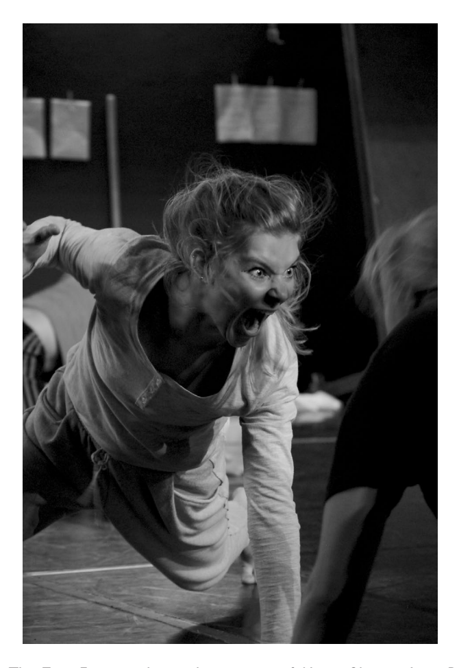
Figure 1 The Tiger Excercise during the creation of Mount Olympus , Lore Borremans, Antwerpen, 2015, Photo by Sam De Mol, Courtesy of Troubleyn/Jan Fabre.

but it corresponds with a practice-based hypothesis that Fabre developed over the years, and is backed up by the experiences of performers: it is a way to slow down the respiratory process and minimise the intake of oxygen (Cassiers 2014). After a challenging physical exercise, the performers are accustomed to breathing too heavily, which can lead to hyperventilation. But in pausing after the exhalation, the performers experience a deeper concentration and stamina (endurance). They also re-establish their centre of gravity more easily.