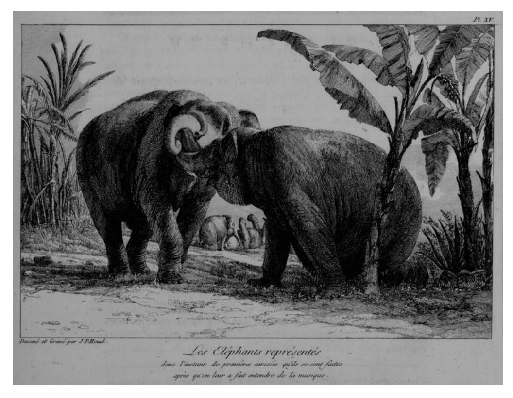
Figure 1. "Les éléphants représentés dans l'instant des premières caresses qu'ils se sont faites après qu'on leur a fait entendre de la musique" ( The elephants shown at the moment of their first caresses upon hearing the music performed for them ). From J.P. L.L. Houel , Histoire naturelle des deux éléphants, male et femelle, du muséum de Paris venus de Hollande en France en l'an VI ( 1803:43 ).

gauge the effects of music on sensitive, living creatures, adding that the experience of pleasure can achieve more than that of pain (1798:257). The concert itself provides numerous indices of this conjunction of music and natural science. Armed with flutes, oboes, and violins ("instead of scalpels and instruments of torture," as Toscan adds), the small orchestra sought to exert