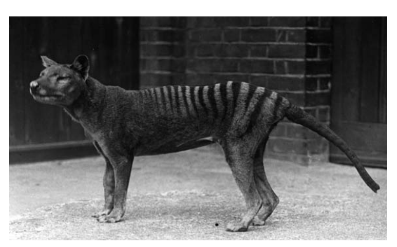
Figure 2. The thylacineis now almost certainly extinct. This 1913 photograph records the last one to be held in captivity in the London Zoo.

Previous history and origin unknown. 1. A quadruped of the genus Canis, numerous races or breeds, varying greatly in size shape and colour [...] referred by zoologists to a species C. familiaris; but whether they have a common origin is a disputed question [...] 3. Applied to a person; a. in reproach, abuse, or contempt: a worthless, despicable, surly, or cowardly fellow. b. Playfully (usually in humorous reproof, congratulation, or commiseration): a gay or jovial man, a gallant: a fellow, 'chap.' 4. Astron. a. The name of two constellations, the Great and Little Dog (Canis Major and Minor) situated near Orion; also applied to their principal stars Sirius and Procyon: see DOG-STAR. b. The Hunting Dogs, a northern constellation (Canes Venatici) near the Great Bear. 5. Applied, usually with distinctive prefix, to various animals allied to, or in some respect resembling, the dog: e.g. burrowing-dog, the COYOTE or prairie-wolf, Canis latrans; pouched-dog, a dasyurine marsupial of Tasmania, Thylacinus cynophelas, also called zebra-wolf; prairie-dog, a North American rodent [...] 7. A name given to various mechanical devices, usually having or consisting of a tooth or claw, used for gripping or holding [...] 9. An early kind of fire-arm. 10. Name given to various atmospheric appearances. a. A luminous appearance near the horizon; also fog-dog, sea-dog. b. Sun-dog, a luminous appearance near the sun, a parhelion. c. Water-dog, a small dark floating cloud, indicating rain.