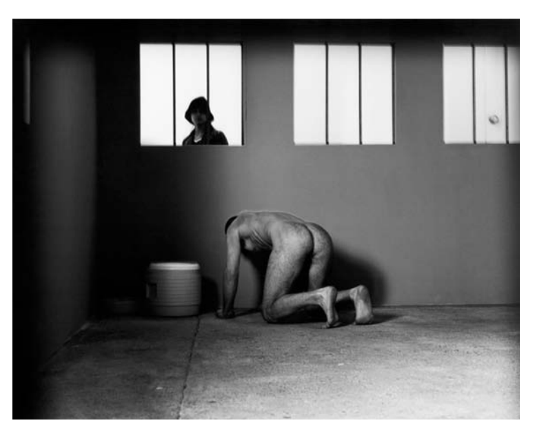
Figure 7. Oleg Kulik in I Bite America and America Bites Me. Performed at Deitch Projects, Grand Street, New York, 12–26 April 1997.

a range of political, philosophical, and ethical propositions through his bodily actions and accompanying statements. Some of the work explicitly denounced the corruption of the international art market and the commodificatory domestication of dissident aesthetics, as well as the Pavlovian conditioning of socialized gallery-goers. Other actions referenced specific political contexts, for example: the introduction of new capital punishment legislation in Russia during the 1990s, Russian elections (in which, like Beuys, Kulik put himself forward as the representative of the "Party of Animals"), the exclusions effected by the European Union, epidemics of animal disease, the fate of Montenegro in the breakup of former Yugoslavia, and so on. In particular, he returned