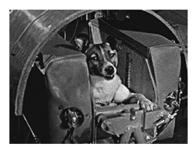
Figure 3. Laika, the first cosmonaut, inside the capsule of Sputnik 2, 1957.

Over a period of weeks, Laika was trained to endure launch and flight conditions. So, for example, to adapt to the cramped space of the cabin, she was kept in progressively