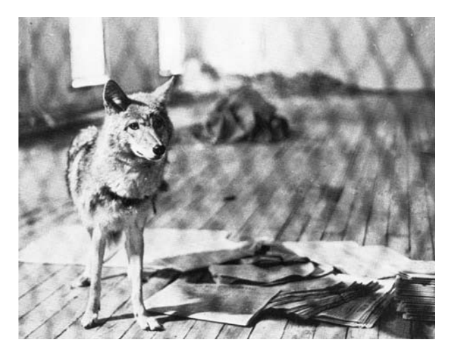
Figure 4. Little John, the animal companion in Joseph Beuys's iconic performance piece, Coyote: I Like America and America Likes Me. René Block Gallery, New York, 1974.

requiring our attention. Under threat since the arrival of European settlers, the coyote had become the quintessential American scapegoat or underdog, hunted and destroyed as a pest, and yet it had more than survived. For Beuys, the covote had its prehistoric origins as an Asiatic steppe wolf (see Kuoni 1990:213); he believed it had crossed from East to West on ice in the Bering Straits thousands of years ago, like the ancestors of Native Americans. So Beuvs's covote was originally Eurasian, and intimately linked to the Siberian wolf, another creature traditionally connected in Siberia and Northeast Asia with shamanic transformation. For him, the coyote's persecu-