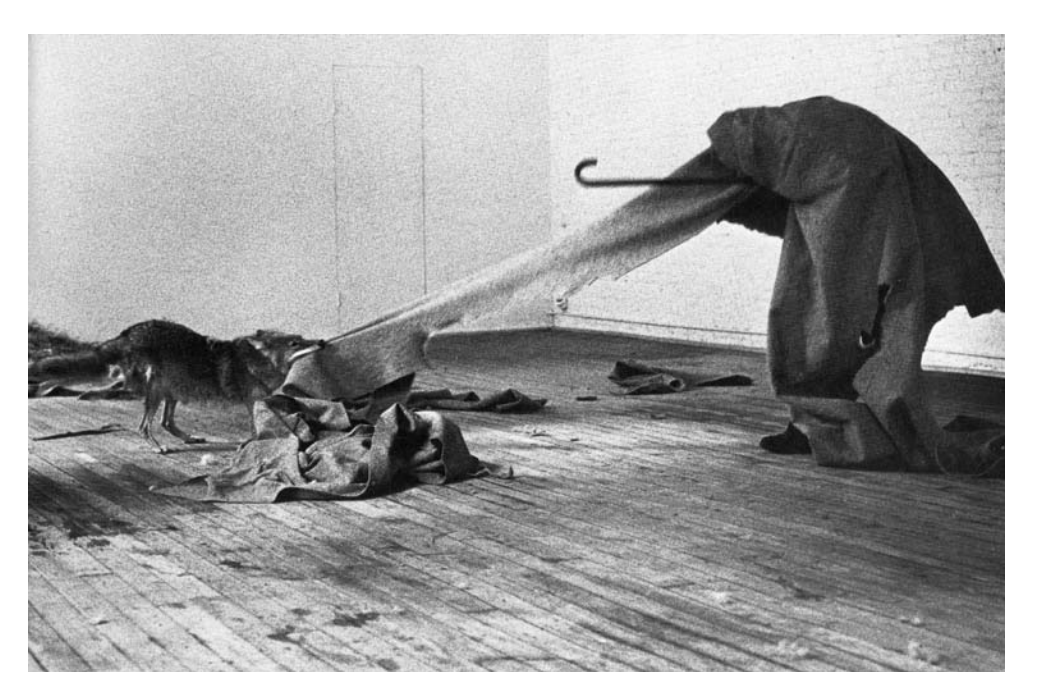
Figure 5. Joseph Beuys and Little John in Coyote: I Like America and America Likes Me. Animal and artist shared three days in an enclosed environment strewn with newspapers, felt, straw, and other objects. René Block Gallery, New York, 1974.

All well and good as an eco-sophical proposition, but there are unresolved questions here. What kind of coyote was Little John? What was his provenance, and does it matter? His purported status as a "wild" animal only recently caught and the degree of his prior interaction with human beings are unverified; and there are all sorts of discrepancies in published accounts. The animal's untamed nature is often highlighted in these descriptions, and it serves to feed the mythological narrative of an interspecies encounter between these representatives of "nature" and "culture." In reality it seems the coyote had been brought to New York from a ranch in New Jersey by his "owner." In one of Tisdall's descriptions of the event, she provides a rare account of what happened after Beuys departed the caged space, as she remembers it: