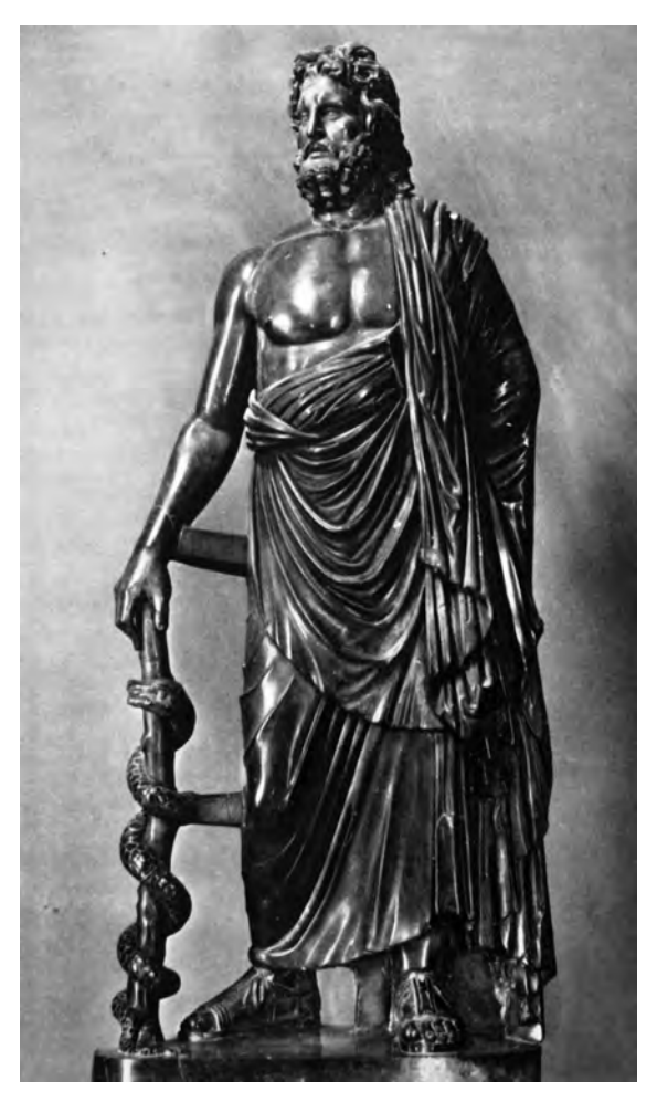
Figure 38: Asclepius/Aesculapius. Bronze statue, 2<sup>nd</sup> century AD. Capitoline Museum, Rome.

Asclepius, Greek god of health and patron saint of physicians, was popularised in the 5<sup>th</sup> century BC, when Asclepian temples of healing first appeared in Epidaurus (Fig. 32) and later spread widely through