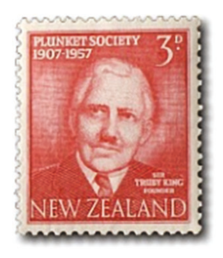
Fig. 1 Commemorative stamp issued in 1957 on the 50th anniversary of the Plunket Society.

a common charge is that he was an ardent eugenist. In his day (and for several decades thereafter) that claim would have seemed preposterous, at least taken as an accusation. King and the Plunket Society were associated with the belief that virtually all babies could and should be saved, a goal that was to be accomplished through the provision of proper nutrition and maternal and infant care. In King's view, eugenists greatly overemphasized the power of heredity in explaining human differences, thus providing a false impression that insanity, criminality and other undesirable traits were typically fixed at birth. One of his favourite expressions, repeated in a multitude of books, pamphlets, articles, interviews and speeches, was that 'environment could knock heredity into a cocked hat'.<sup>4</sup> A more unlikely adage for a eugenist is hard to imagine.