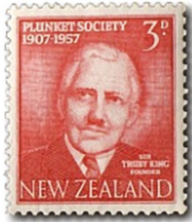
Fig. 1 Commemorative stamp issued in 1957 on the 50th anniversary of the Plunket Society.

a common charge is that he was an ardent eugenicist. In his day (and for several decades thereafter) that claim would have seemed preposterous, at least taken as an accusation. King and the Plunket Society were associated with the belief that virtually all babies could and should be saved, a goal that was to be accomplished through the provision of proper nutrition and maternal and infant care. In King's view, eugenicists greatly over-emphasized the power of heredity in explaining human differences, thus providing a false impression that insanity, criminality and other undesirable traits were typically fixed at birth. One of his favourite expressions, repeated in a multitude of books, pamphlets, articles, interviews and speeches, was that 'environment could knock heredity into a cocked hat'. 4 A more unlikely adage for a eugenicist is hard to imagine.