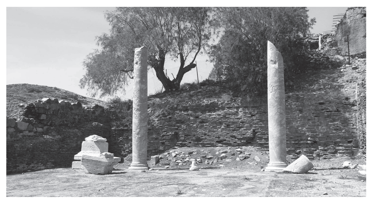
Figure 3.3 Lebena Sanctuary, Crete.

support the political union between Crete and Cyrenaica. This can be compared to several texts from ancient writers of the Augustan period, which precisely refer to the links between Crete and Africa (Virgil, Ovid, Horace: see references and commentary in Braccesi 2004).