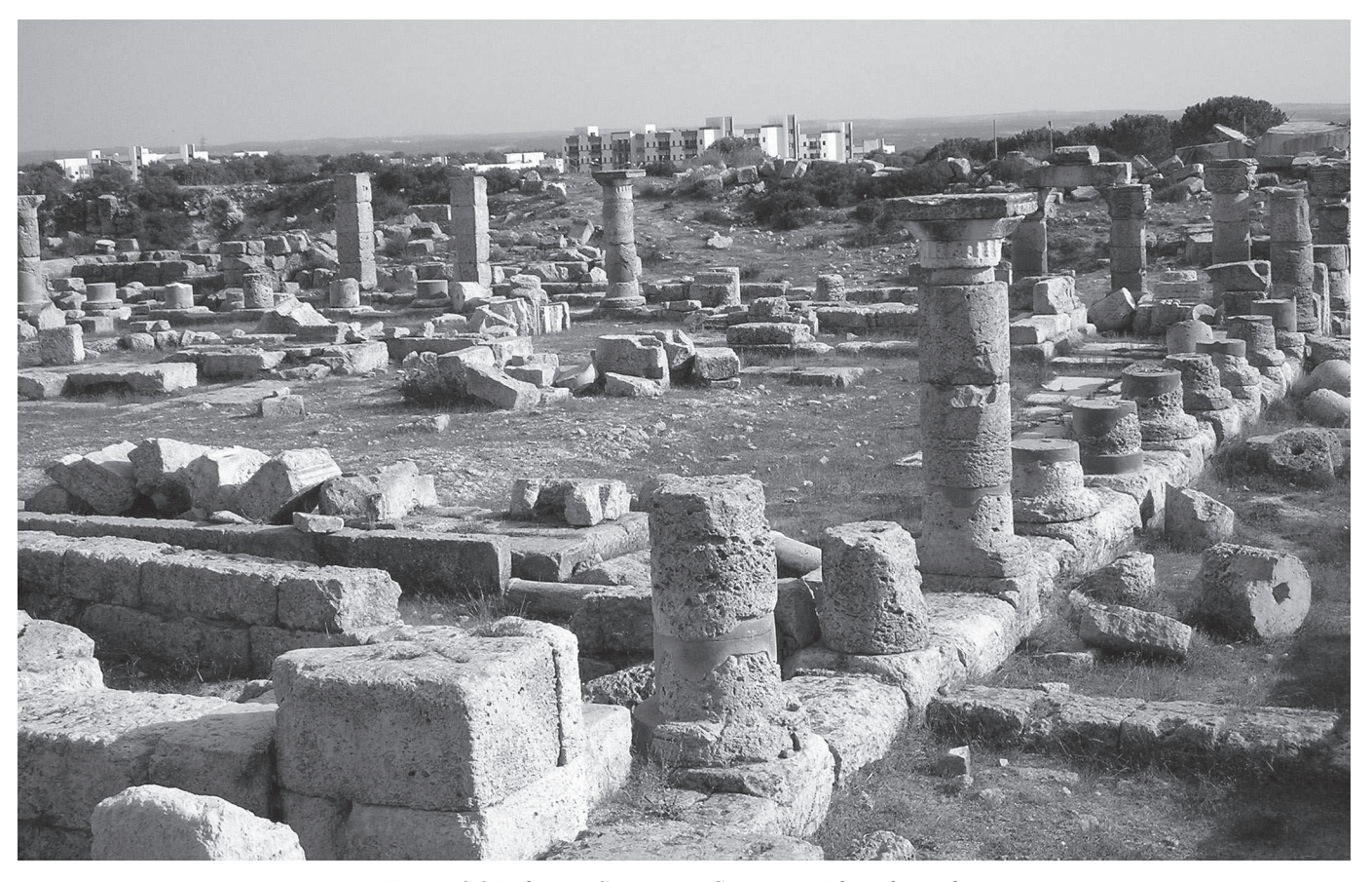
Figure 3.2 Balagrae Sanctuary, Cyrenaica.

After Pausanias (2.26.9), it is accepted that the cult of Asklepios was brought from the sanctuary of Balagrae in Cyrenaica (Fig. 3.2) to the sanctuary of Asklepios in Lebena, on the southern shore of Crete (Fig. 3.3). According to Melfi, Pausanias may have known that story based on the information that Aelius Aristides brought back from his journey in Egypt in AD 142-143 (Melfi 2007, 125-7). And yet, we have no texts that indicate the truth on this matter. Melfi shows that no inscriptions can prove the anteriority of the Libyan sanctuary; she thinks that the filiation is impossible and prefers to see a direct influence from Epidauros on the foundation of the Lebena sanctuary (Melfi 2007, 127-32). My point here is not to discuss this question, but to note that all the information we have about this possible filiation goes back to the Imperial period, with the text of Pausanias. It is therefore not impossible that this myth of a direct translation of the cult of Asklepios from Balagrae to Lebena was a Roman recreation. It would have helped to