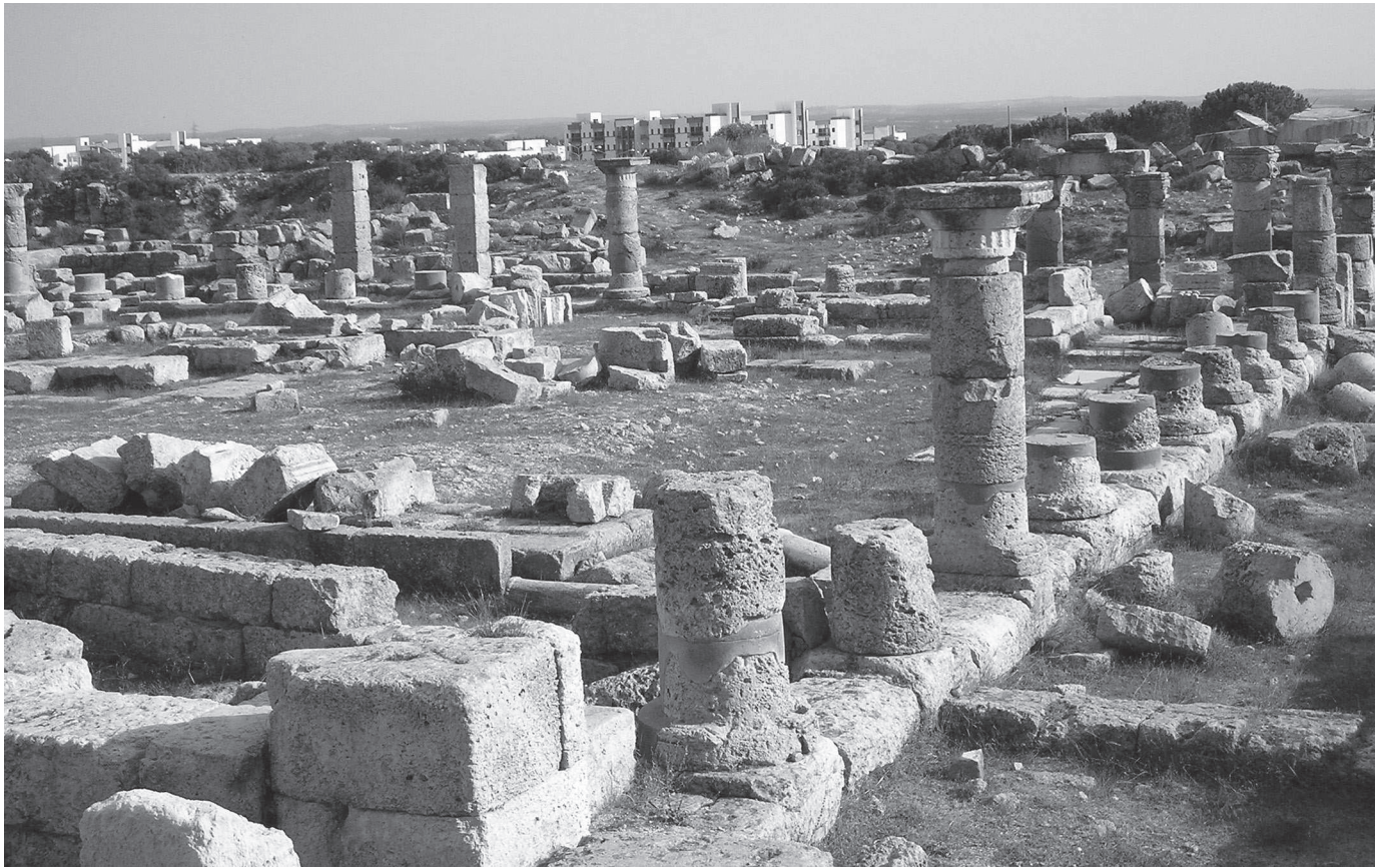
Figure 3.2 Balagrae Sanctuary, Cyrenaica.

After Pausanias (2.26.9), it is accepted that the cult of Asklepios was brought from the sanctuary of Balagrae in Cyrenaica (Fig. 3.2) to the sanctuary of Asklepios in Lebena, on the southern shore of Crete (Fig. 3.3). According to Melfi, Pausanias may have known that story based on the information that Aelius Aristides brought back from his journey in Egypt in AD 142–143 (Melfi 2007, 125–7). And yet, we have no texts that indicate the truth on this matter. Melfi shows that no inscriptions can prove the anteriority of the Libyan sanctuary; she thinks that the filiation is impossible and prefers to see a direct influence from Epidauros on the foundation of the Lebena sanctuary (Melfi 2007, 127–32). My point here is not to discuss this question, but to note that all the information we have about this possible filiation goes back to the Imperial period, with the text of Pausanias. It is therefore not impossible that this myth of a direct translation of the cult of Asklepios from Balagrae to Lebena was a Roman recreation. It would have helped to