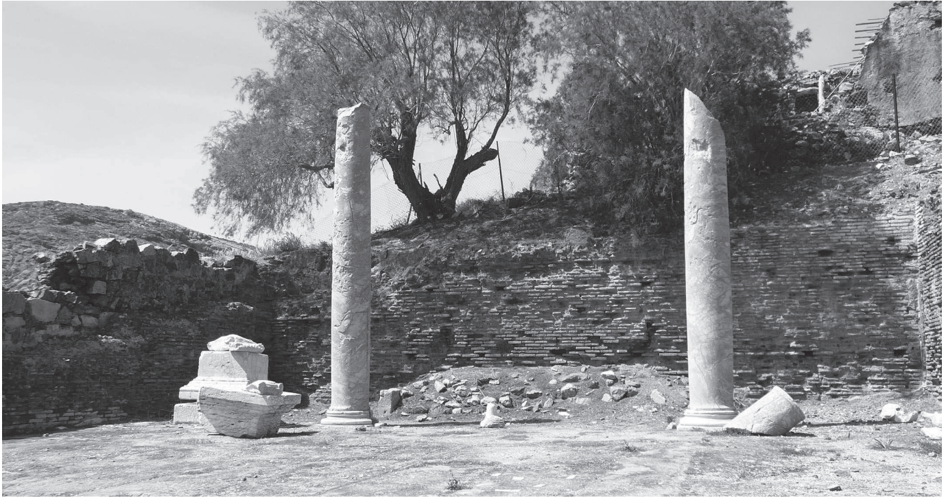
Figure 3.3 Lebena Sanctuary, Crete.

support the political union between Crete and Cyrenaica. This can be compared to several texts from ancient writers of the Augustan period, which precisely refer to the links between Crete and Africa (Virgil, Ovid, Horace: see references and commentary in Braccesi 2004).