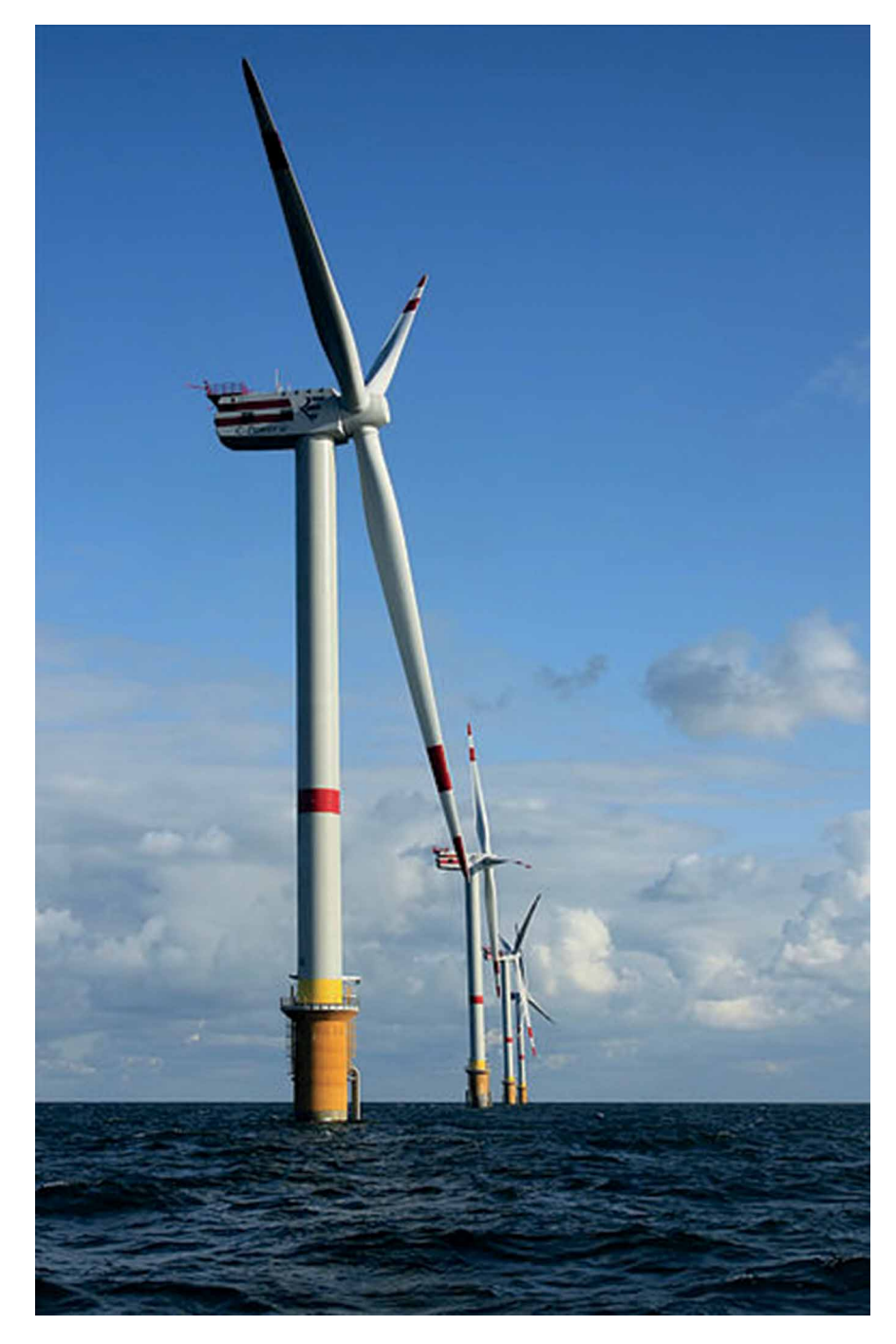
Figure 1. Wind turbines, Thornton bank, Belgian coast of the North Sea. Credit: © Hans Hillewaert/ CC-BY-SA-3.0 The photographer is not responsible for the arguments presented in this paper. Source: http://en.wikipedia.org/wiki/File:Windmills_D1-D4_%28Thornton_Bank%29.jpg