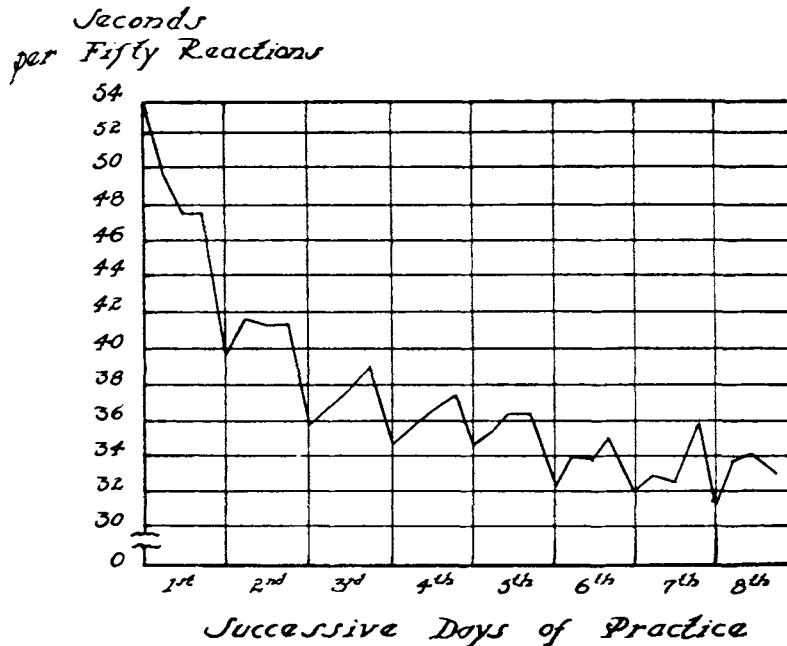
Figure 2. Mean scores for the group in each of the four half-sheets of the NCWd test, which constituted the daily practice.

The variability of the group is increased by the increase in interference due to practice on the NCWd test. The coefficient of variability increases from .15 \pm .013 to .34 \pm .031 , the difference divided by its probable error being 5.65. This is not surprising as the degree of the interference varies widely for different subjects. Its degree is determined by the learning on the practice series which is shown by the individual results to vary considerably. One day's practice on the RCNd test reduced the variability from .34 \pm .031 to .25 \pm .022 . The decrease in variability is 2.3 times its probable error.