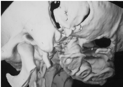
FIGURE 1. Three-dimensional reconstruction of a computed tomographic scan of the bony cranium demonstrating the extent of the craniotomy.