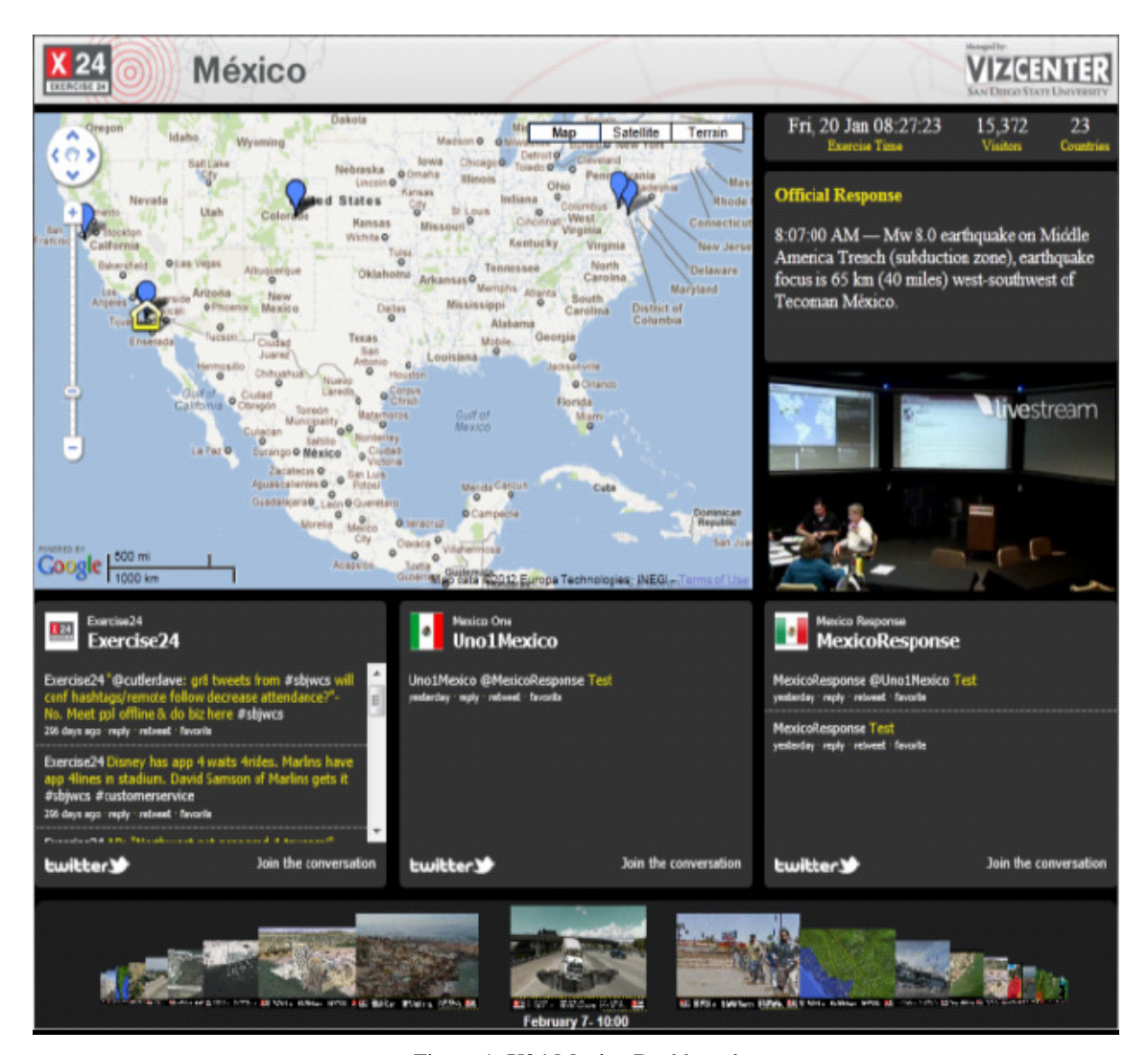
Figure 1: X24 Mexico Dashboard

Additionally, the SDSU VizCenter was used as a neutral and informal meeting location, dubbed "Academic Geneva." This was necessary as the protocols for visiting officials make informal talks between these officials nearly impossible. The collaborative surroundings of the VizCenter along with a large multi-screen display of the X24 Mexico dashboard made these meetings productive and conducive to relationship building.