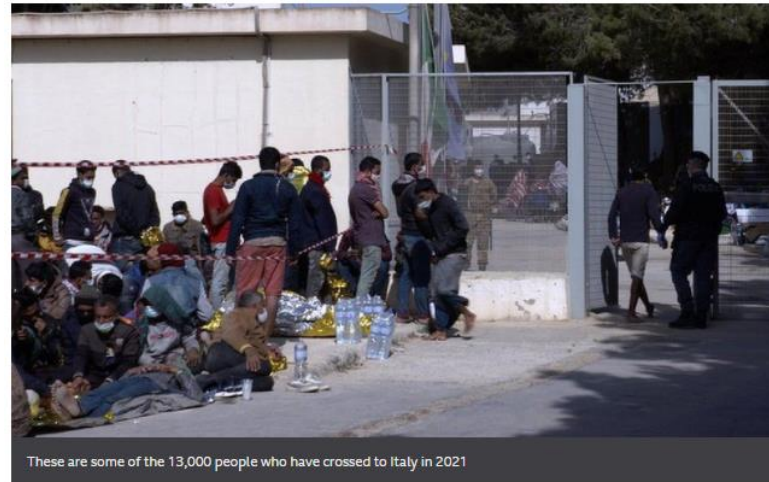
These are some of the 13,000 people who have crossed to Italy in 2021

Cloaked by darkness and guarded by police, they huddle together at the port: the latest migrants to reach Lampedusa, out of the shadows and into Europe.