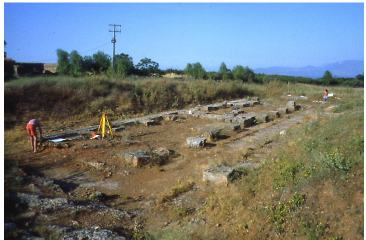
Fig. 1 - Survey work at the temple site in June 1984: Dag Iver Sonerud and Hans Olav Andersen.

It is now clear that the temple had three building phases of very different aspect: a long and narrow, peripteral hellenistic temple, from the years after the