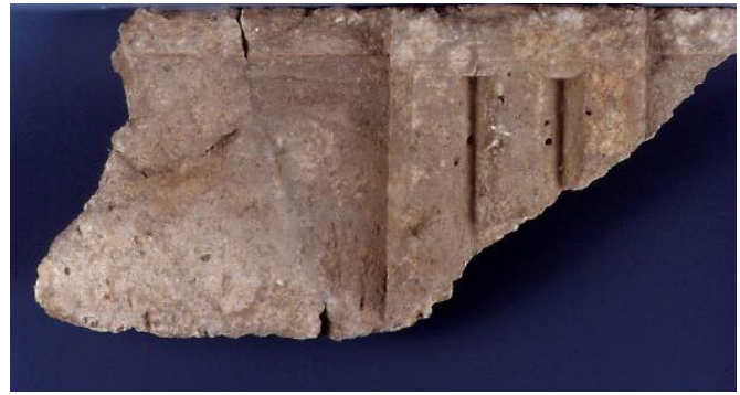
Fig. 6 - Block with triglyph and metope from the hellenistic temple. (Photo: Kalliopi Krystalli-Votsi).

The plan of the temple is a refined and subtle mixture of old and new elements. The elongated proportions of the plan reach back to very early temples, of the 7th rather than the 6th century, and are unthinkable without a knowledge of them. With such a consciously archaizing plan the old traditions of the temple were adequately emphasized. If this actually was the temple of Apollo mentioned by Pausanias, it had according to him been founded by Proitos at the site where his daughters had been cured of their madness, and ancient relics had been kept in it before it was destroyed by fire: Meleager's lance, the cauldron where the Peliads had boiled their father, and the voting stone used by Athena during the final