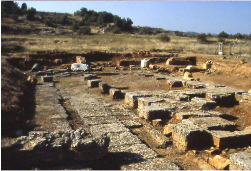
Fig. 9 - The southern flank of the temple foundation, with a possibly early archaic line of blocks inside the hellenistic (far left) and archaic (to the right of those) foundations.

foundation not very far from its eastern end, thus defining the transition to the foundations which were added later for the hellenistic temple front. We consequently have three sides of a rectangle measuring about 10.05 x 30.90 m, with foundations 1.40 to 1.50 m wide. There was no peristasis surrounding this building.