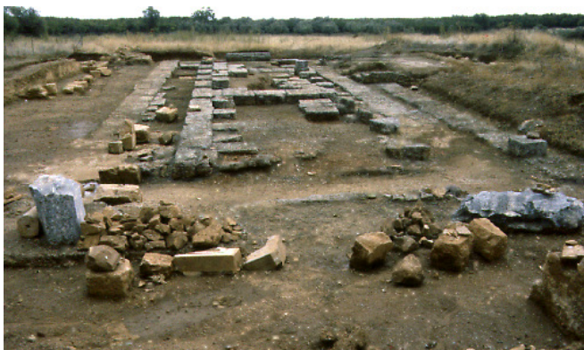
Fig. 3 - View of the temple, from West. (Photo: Erik Østby).