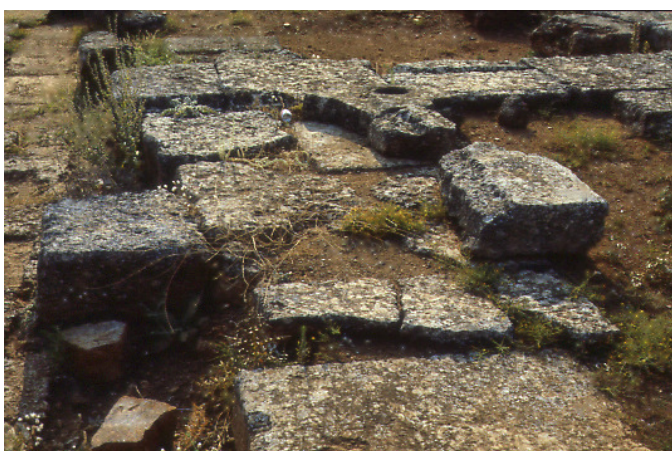
Fig. 5 - The cult complex in the SE corner of the Hellenistic cella, with rests of a circular base probably for a monumental tripod..

into it, probably for a system of decorative columns or supports near the wall. The divisory wall between pronaos and cella was built on earlier foundations. The cella room behind it is normally shaped, somewhat more than twice as deep as it is wide (4.90 x 10.70 m), and a system of decorative supports along the walls probably existed also here, carried by blocks with deep foundations placed at regular intervals in a bench slightly raised above the surface of the floor (fig. 4). Three pavement slabs are left of a system which could cover the entire floor between those benches with 8 x 4 slabs of the same dimensions. A special arrangement would have been necessary in the inner left corner, where the pavement had to respect a circular slab resting on a complicated system