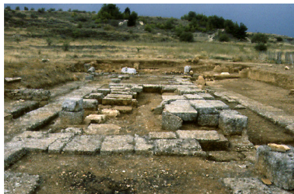
Fig. 4 - The interior of the Hellenistic cella, seen from East.