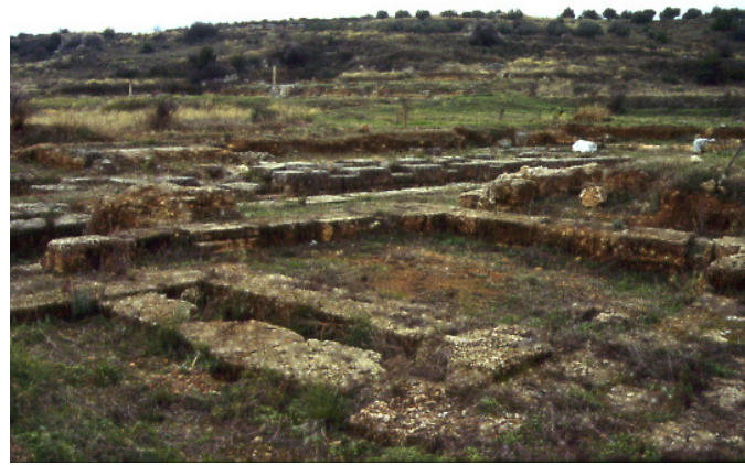
Fig. 7 - Foundations for the altar, at the northern flank of the temple. (Photo: Erik Østby).