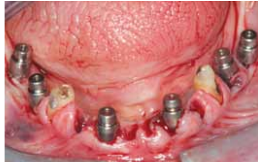
FIG. 2C Closed tray impression copings were mounted on the implants immediately after insertion.