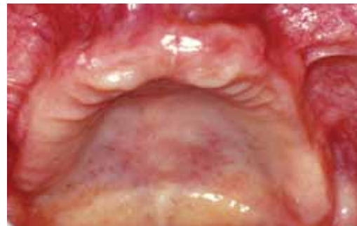
FIG. 1B Preoperative clinical situation of edentulous maxilla.

The presence of sufficient residual bone volume was confirmed radiographically. In all cases orthopantomographic imaging was followed by detailed three-dimensional cone-beam localized volumetric tomography (Morita Accuitomo, Japan) (Fig. 1a). Only patients that presented supporting bone of at least 13