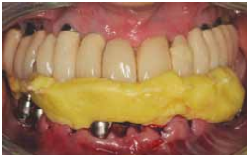
FIG. 2D Initial occlusal registration procedures were immediately performed on the impression copings by using polyether registration material.