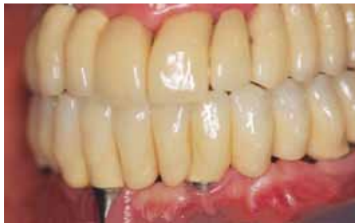
FIG. 2G One year postoperative appearance intraorally.

which the heads were found to be below the soft tissue crest, open tray impression copings were used by simply snapping them on the implant head, without fastening them by the stabilizing screw. By doing so, the retentive impression coping head was engaged and lifted by the closed tray impression material and therefore a more