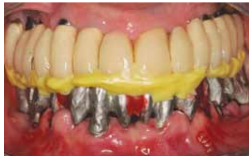
FIG. 2E Improvement of the passivity of the fit of the metal framework was followed by corrective occlusal registration during try-in.