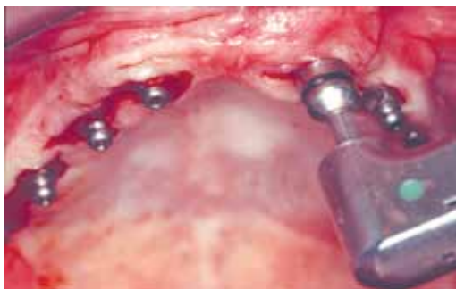
FIG. 1C Flapless implant surgical insertion by levelling the threaded-smooth interface with the soft-hard tissue interface.

intimate soft tissue adaptation on the coronal part of the implant remains undisturbed. Therefore the maintenance and the preservation of the pre-existing soft tissue architecture are fairly accomplished. The aim of the present case series is to illustrate a clinical technique and present the application of one-piece transmucosal implants in flapless surgical procedures, supporting multiple implant immediate full arch prostheses.