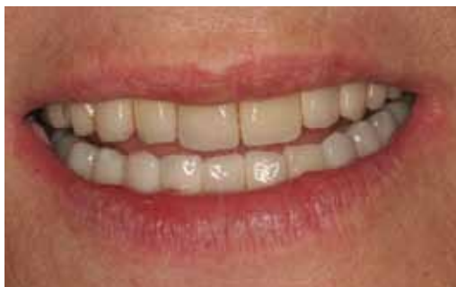
FIG. 2F One year postoperative appearance extraorally.