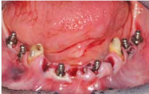
FIG. 2B Immediate intrasocket implant placement providing adequate soft tissue support and preservation.