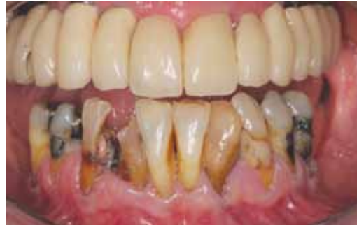
FIG. 2A Preoperative clinical situation of terminal mandibular dentition.

were mounted on the implants immediately after insertion (Fig. 2c). Although an open tray impression procedure would have been preferable for precision, a closed tray was used. The reason was that the existing open tray impression coping, originally designed for single implant restorations, is firmly engaging the external anti-rotational mechanism located on the head of the implant. In that way upon removal some of the impression copings would not eventually freely disengage. Occasionally however, on specific implants in