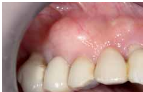
Fig. 1 Clinical features of the right sided exostosis of Case 1 showing an ovoid lesion of hard consistency covered by normal mucosa in the premolar area of the maxillary buccal cortex.

noticed about 12 months following the dental implant placement and 7 months after the final prosthesis was in place. They remained asymptomatic although progressively increasing in size. On clinical examination, the lesions were found to be covered by normal mucosa, hard in consistency, each measuring about 2 cm in maximum with a height of approximately 0.7 cm (Fig. 1). Periodic radiographic examination consisted of panoramic radiographs and dental computed tomography (local volumetric tomography, Aquitomo, Morita, Japan). Dental CT images were comparable, because they were taken with the same hardware and were digitally processed so to be three-dimensionally oriented along the long axis of the implants and perpendicularly to the tangent of the curve of the