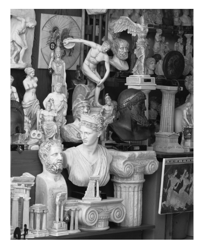
Figure 1.6 Athens, 'Greek art' replicas on sale in one of the city's souvenir shops, 2011.