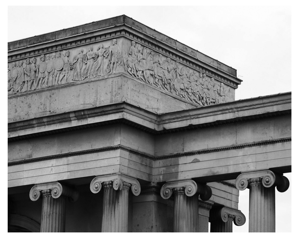
Figure 1.4 London, Hyde Park Gate, designed by Decimus Burton with a free version of the Parthenon frieze designed by John Henning, 1825.

nation-state, modeled on an imagined ancient Greek paradigm. The Bavarian aristocracy which was called in to supply the new state's elite brought Neoclassicism in its luggage, albeit a rather academic, sterile version of a once vibrant movement. Public buildings were designed à la grecque as a matter of course and soon enough local versions of this 'traditional' architecture would follow, to such an extent that today Neoclassicism is thought of as 'typically Athenian' (Figure 1.5). As the Greek economy became increasingly touristbased during the 20th c., a heritage industry, catering primarily for the country's dollar-bearing visitors, created colloquial versions of 'Greek art'. The world was being reminded of an old debt - one that multiculturalism and globalization threatened to erase as we reached the beginning of the 21st c. (Figure 1.6). Classical archaeology, then, has been a product of modernity's systematic attempt to colonize 'its' Greco-Roman past, as well as one of this effort's most able agents (Dyson 2006; Damaskos and Plantzos 2008). Greek art comes to us burdened by its own afterlife. Its 'decolonization' cannot mean a utopian return to an idealized 'authentic' state, sadly comprehensible only to the Greeks themselves. This Companion, thus, is an attempt to outline the ways