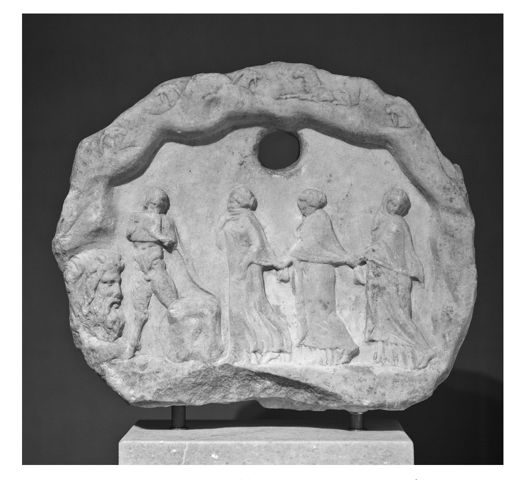
Figure 1.2 Attic marble votive relief from Eleusis. Cave of Pan . 4<sup>th</sup> c. BC (Athens, National Museum 1445.).

of tiny lead figurines in the form of gods, goddesses, warriors (Figure 1.3), dancers, musicians, and animals. Cemeteries and tombs located all around the Greek world have been equally important in preserving visual and material culture. In addition to informing us about burial customs, demography, and prestige goods, the necropoleis of the Kerameikos in Athens have been the single most important source for Geometric pottery (e.g. Figure 3.2), and the painted tombs at Vergina (Figure 8.4; Plate 8) the best surviving evidence for wall-painting of any period. Arguably, most of our current knowledge about Boeotian black-figure vases (e.g. Figure 4.3) stems from the excavations of the graves at Rhitsona conducted by P.N. and A.D. Ure early in the 20<sup>th</sup> c. The ongoing exploration of many sites confirms their importance as producers or consumers (or both) of ancient Greek art and architecture, and through this lens continues to advance our knowledge of society, religion, the economy,