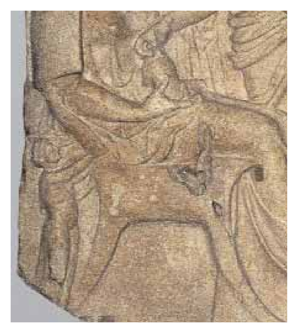
Fig. 7. Detail of marble grave relief from Boeotia, late fifth century b.c. Athens, National Archaeological Museum, 1861.

As we have no representations of the Arrhephoria, we depend for information on the account of Pausanias (1.27.3), dating from the second century a.d. It is related to his visit to the temple of Athena Polias on the Akropolis (fig. 2) and the nearby shrine of Pandrosos, Kekrops' daughter. The passage