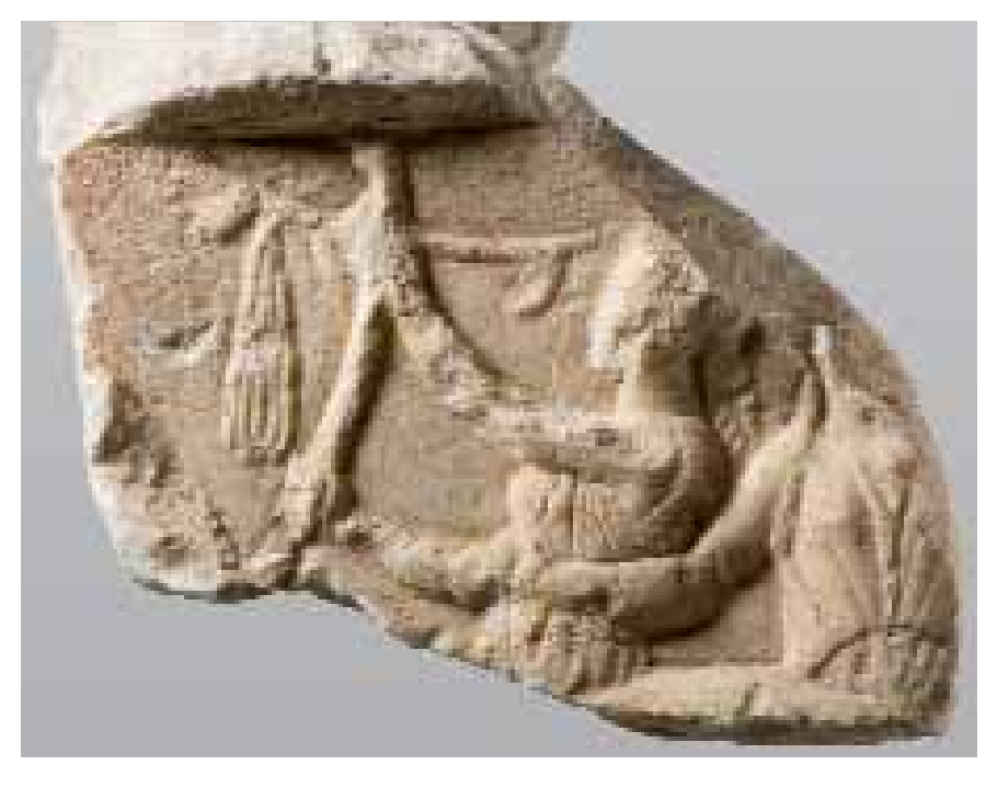
Fig. 6. Marble statue base of arrhephoros with the Graces from the Athenian Akropolis, fourth century b.c. Athens, Akropolis Museum, 3306.