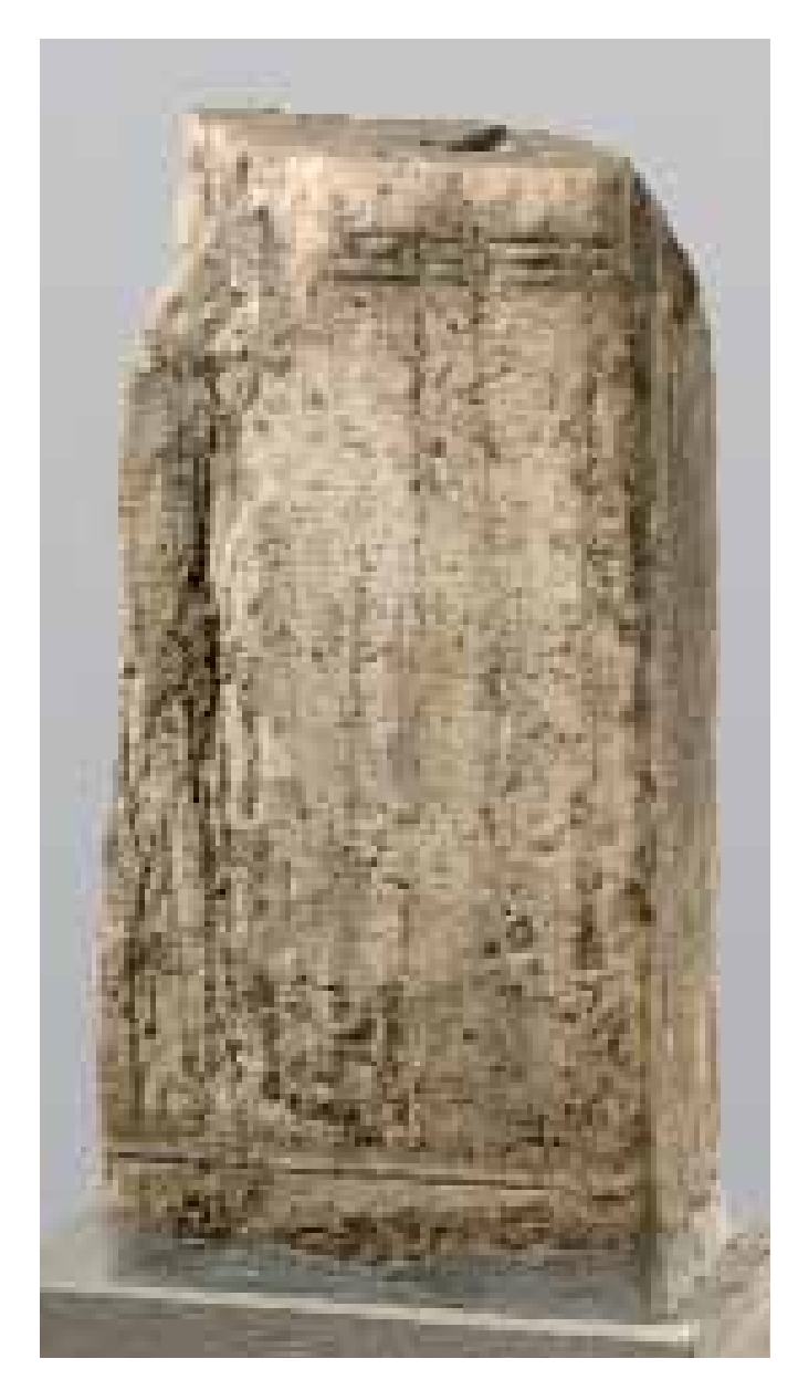
Fig. 4. Marble statue base of the arrhephoros Anthemia from the Athenian Akropolis, second century b.c. Athens, Epigraphical Museum, 10863

of crafts. The warp for the peplos of Athena was ritually set up on the loom by the priestesses of Athena and the arrhephoroi on that day. It is not clear which priestesses were involved. The arrhephoroi were little girls of the Athenian aristocracy, ages seven (Aristophanes, Lysistrata 641) to eleven. They were appointed in Skirophorion, the last month of the Attic calendar, to reside on the Akropolis for a year and perform certain rituals in honor of Athena Polias. Four girls were said to be elected by the people, out of whom the Archon Basileus selected two (Deinarchos apud Harpokration, s.v. arrhephorein). The upkeep of the arrhephoroi formed the subject of a liturgy, that is, it elicited private sponsorship (Lysias 21.5). The honor of being chosen to serve as an arrhephoros was occasionally commemorated