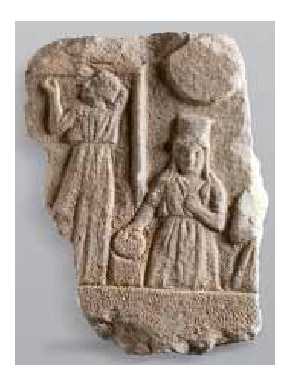
Fig. 5. Marble votive relief of the Graces with arrhephoros at the loom from the Athenian Akropolis, fourth century b.c. Athens, Akropolis Museum, 2554.