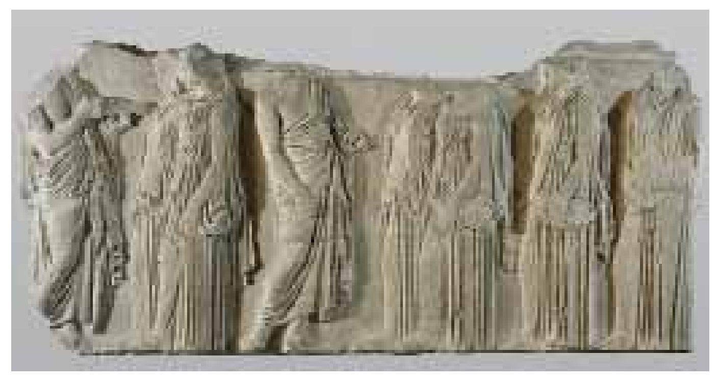
Fig. 3. Parthenon frieze, slab VII: The Ergastinai, about 440 b.c. Paris, Musée du Louvre, Ma 738.