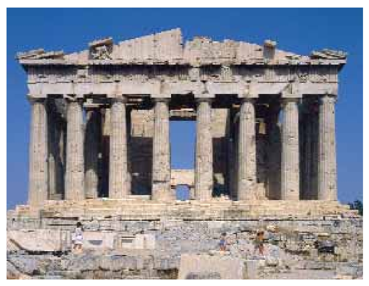
Fig. 1. View of the Parthenon.

If we wish to chart the cultic duties of little girls according to the Attic festival calendar, we must begin with the Panathenaia. This was Athena's greatest festival and was held on the first month of the Attic year, Hekatombaion, which fell in mid-summer. It was celebrated with games and competitions, a grand procession to Athena's altar on the Akropolis, and a sacrifice on a colossal scale. Every four years,