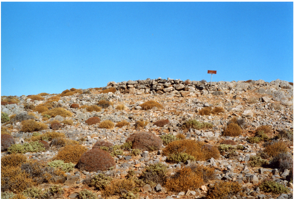
Figure 2: View of the peak sanctuary at Petsofas from the south-west.

Caves are another context for ritual activity in Bronze Age Crete (Rutkowski 1986: 47-72; Tyree 2001; 2017). They had been used as hosts of social gatherings since the Neolithic (Tomkins 2013), as burial places and some of them, such as the Idean cave, as foci of ritual activities (Manteli, 2006). The Eilytheia cave at Amnisos may have been used either for burials or for cult activity