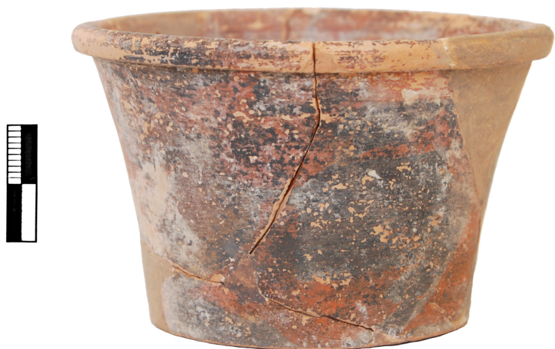
Figure 3: A Kamares ware drinking vessel from tholos tomb B at Apesokari.

The spreading of popular cult and of other ritual practices in the Old Palace period may also be considered as a sign of the emergence of the multitude. The fact that different arenas for public ceremonies appeared at about the same time agrees with the idea that the multitude creates different focal points, each of which is discrete and independent of the others, but at the same time one affects the other. The delicate balance between similarity and diversity within a single ritual arena is also telling. Peak sanctuaries are the best example of this balance. They all share a set of common features, such as elevation, the general