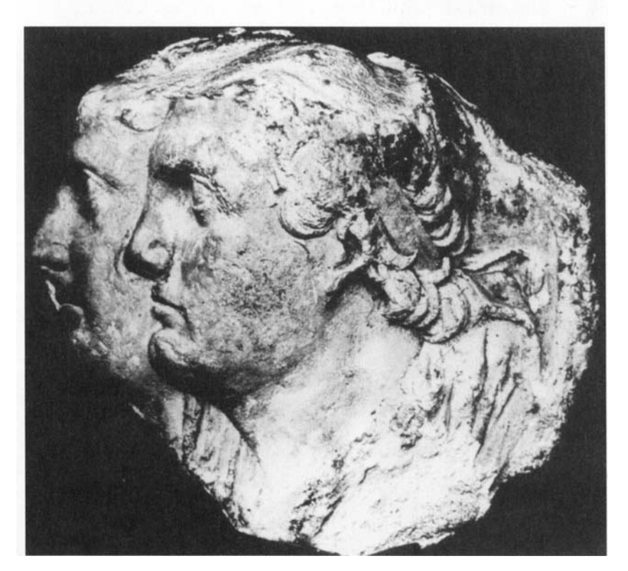
Plate 22a Garnet bust; collection of the J. Paul Getty Museum, Malibu, California. Inv. no. 81. AN. 76. 59 (h: 18 mm)

Plate 22b Chalcedony 'mask'; the Vatican Museums. Plate 22c Plaster cast; Ptolemy I Soter and Berenike I; the Greco-Roman Museum, Alexandria. Inv. no. 24345 (diam: 150 mm).