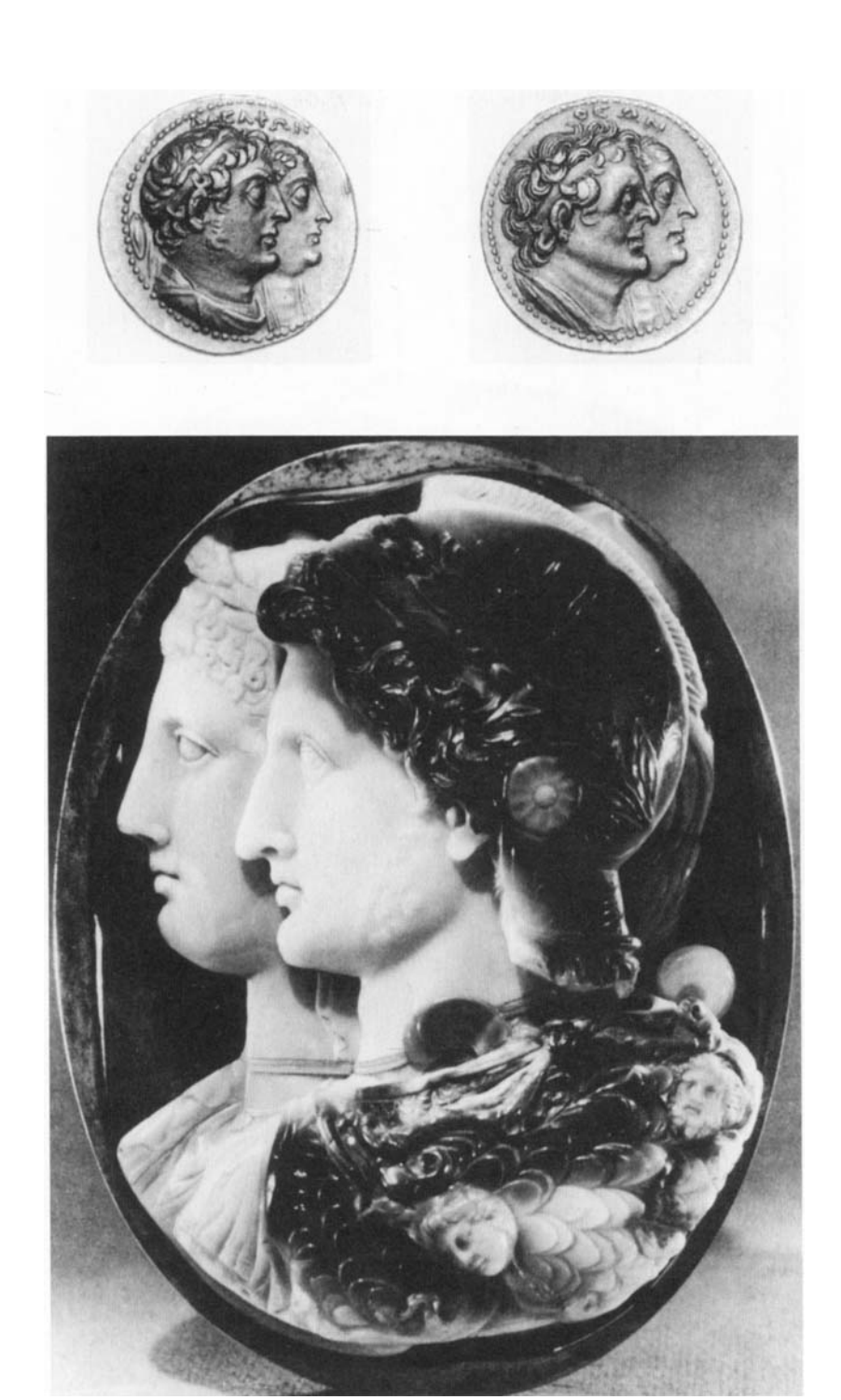
Plate 23a Gold octodrachm; Ptolemy I with Berenike I and Ptolemy II with Arsinoe II (mid-3rd century BC). Art market.