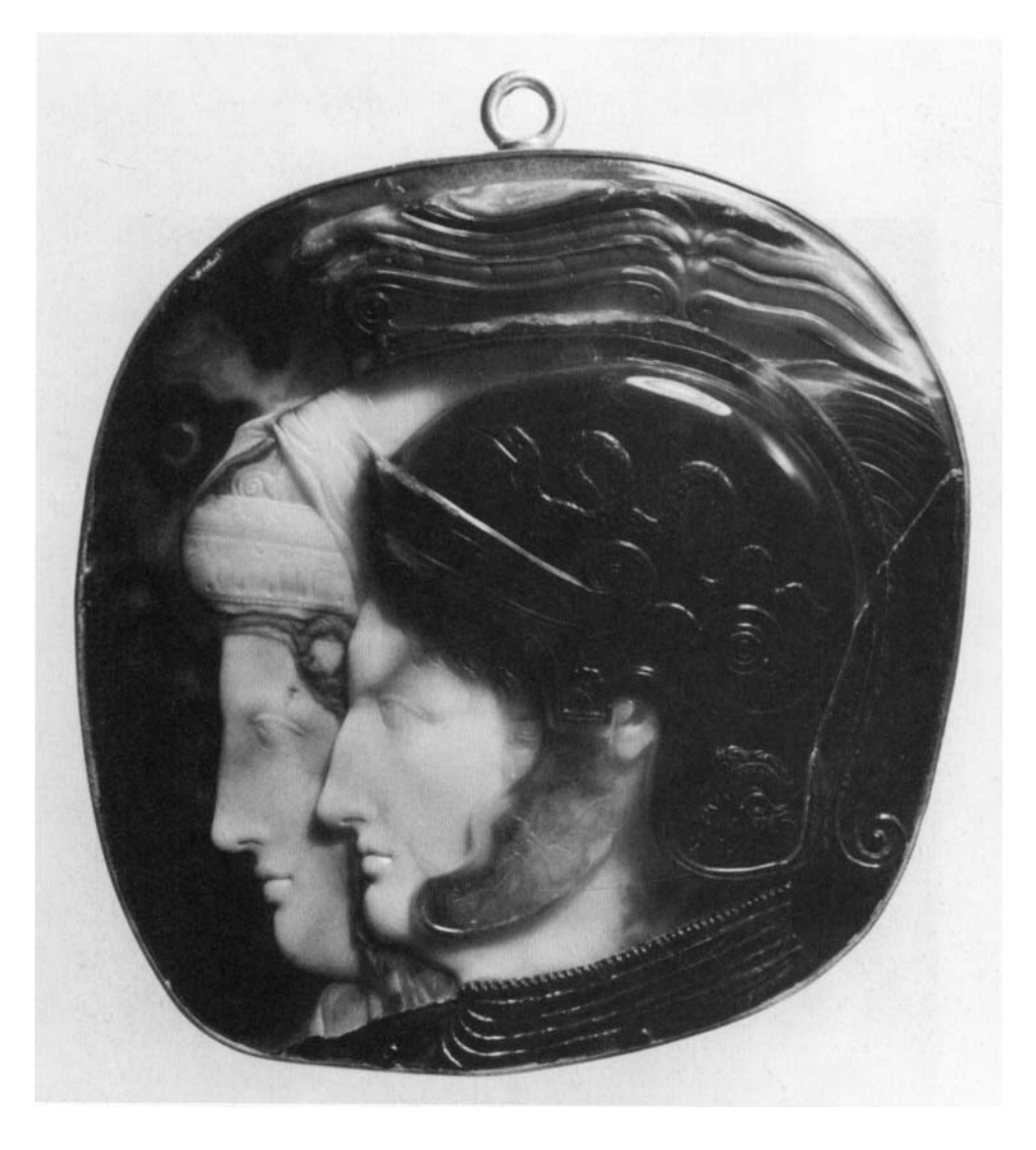
Plate 24 Sardonyx cameo; Kunsthistorisches Museum, Vienna. Inv. no. IXa 81 (115 x 113 mm)