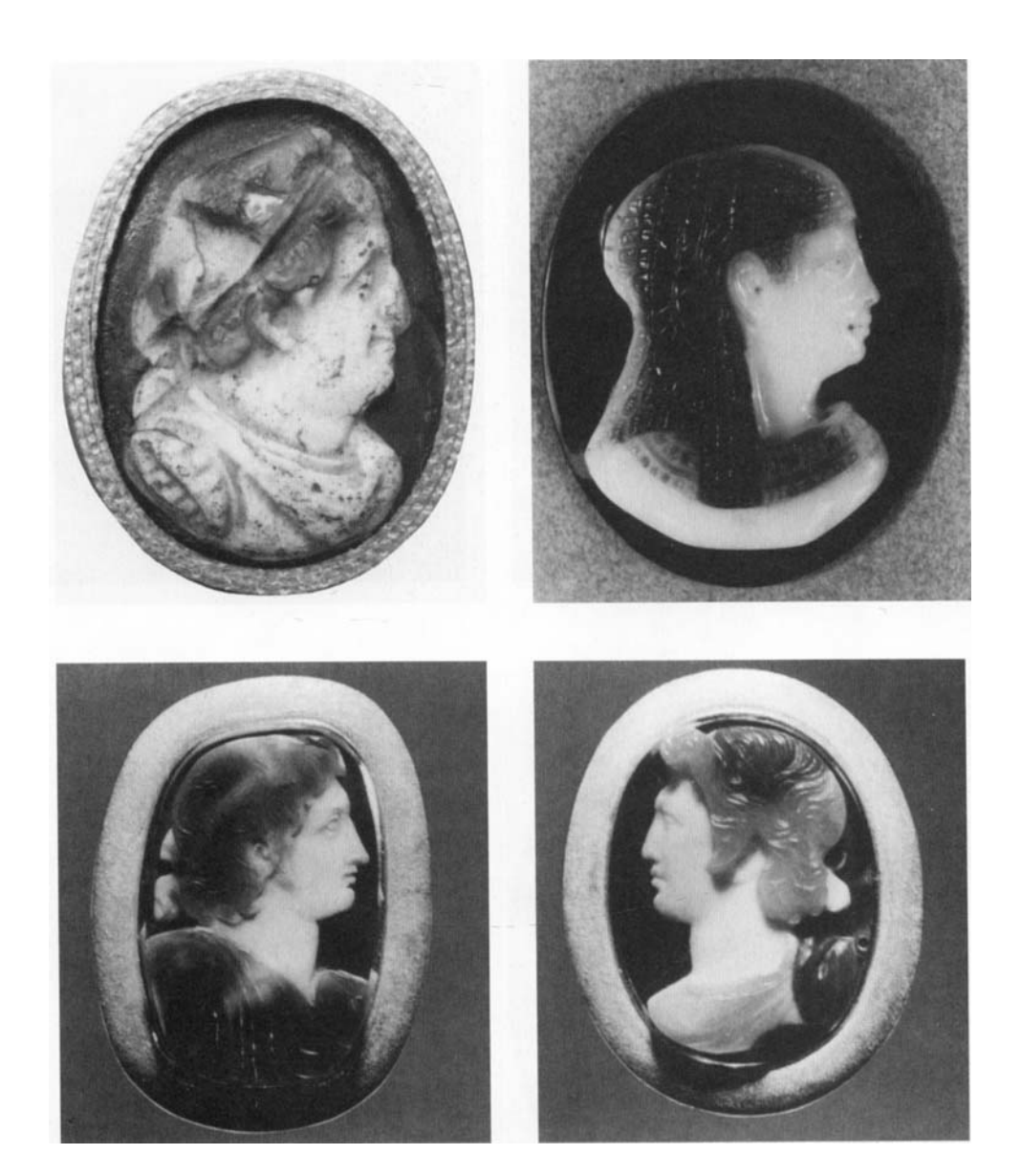
Plate 26a Glass cameo; a late Ptolemy (116-81 BC); the British Museum, London. Inv. no. 3824 (25 x 18 mm) Plate 26b Sardonyx cameo; Isis; Museum of London. Inv. no. A 14271