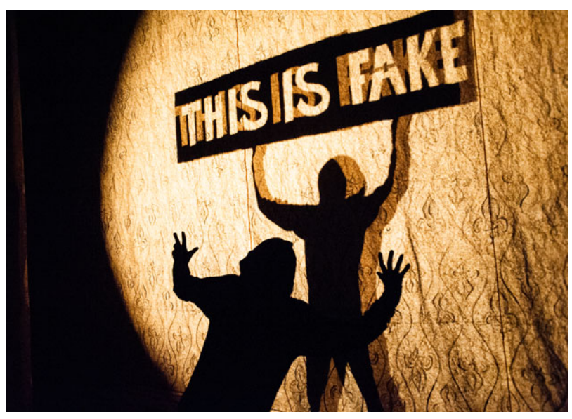
Photo 2. Two of the supernumeraries from the end of the first half of Dark Matters (2009).

Coincidentally, it is at this point that both the follow spot and the voice-over from the opening return, with the former eventually picking out of the detritus the half-buried arm of our protagonist-creator as the latter repeats, in a loop, the same lines from Voltaire. Once again the text, in this instance, functions less as a prophecy to be confirmed through our visual interpretation of the scene before us than as a sonic score. It is the basso-continuo that through its repetition becomes a kind of gestural noise and that, in my post-evental recollection of the performance and repeated recitation aloud of the quoted text, provides an additional modal frequency through which to register—to feel—the otherwise noiseless entrance from the wings of one lonely supernumerary. Her hands and feet skirt the edge of the follow spot as she approaches the apparently dead creator. Tugging at his arm, the supernumerary eventually frees his entire body, props him up like a dummy, and begins to help him to walk. And then, because we are still quite clearly in