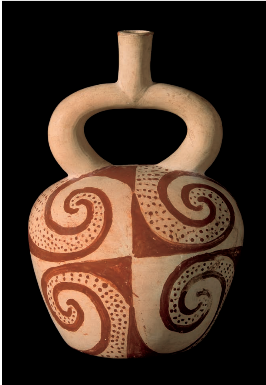
Early Moche stirrup-spout vessel. The volutes in the painted design might refer to ocean waves or the tentacles of an octopus. The design typifies Moche artists' delight in playing with positive and negative spaces that express opposed but complimentary forces or things. PM 09-3-30/75626.9 (W 17 × H 21.5 cm). 98540019.