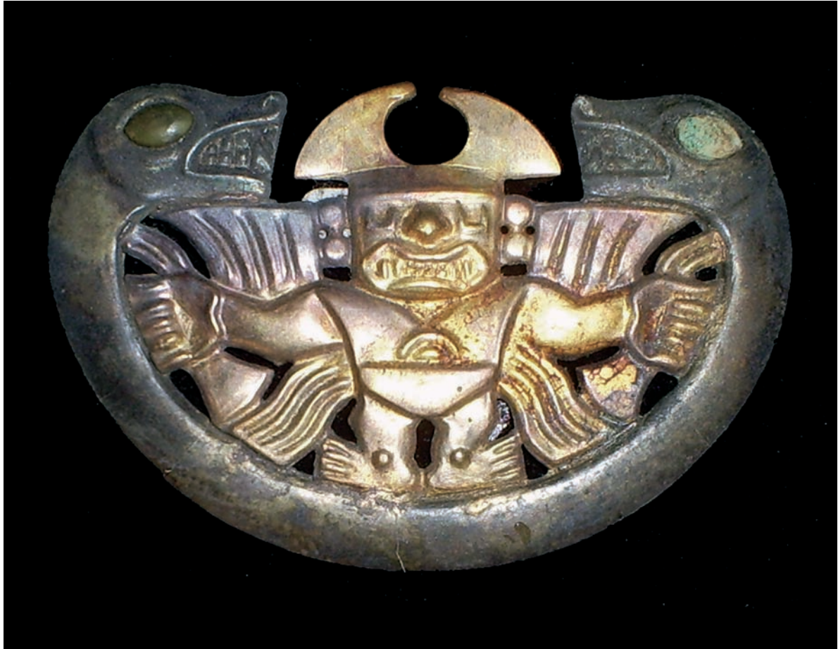
Nose ornament, silver and gold alloy, depicting the deity called the Decapitator standing on a two-headed feline-serpent. The ornament was buried with the Señora de Cao, a high-status young woman at the site known as Huaca Cao Viejo.