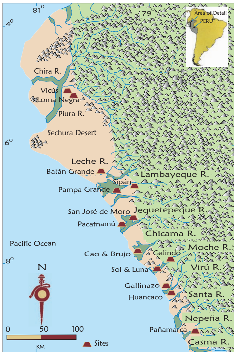
The north coast of Peru, showing principal Moche archaeological sites. Many more than these exist.

Details of the origins and demise of the Moche style are unclear and are currently being investigated. Researchers commonly think of the Moche Valley and neighboring Chicama Valley as the Moche heartland, but variants of the art style were eventually made as far north as the Chira Valley and as far south as the Nepeña Valley.