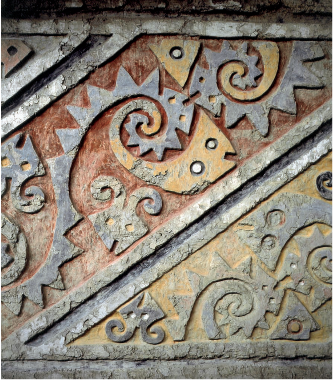
Detail of the Maritime Frieze at Huaca Cao Viejo, Chicama Valley, Peru.