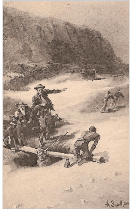
Looting of Peruvian archaeological sites was celebrated in popular literature in the nineteenth century. In this illustration from The Gold Fish of the Gran Chimú , by Charles F. Lummis (1895), hard-working looters defend their "rights" against a proposed law banning excavations in the "mummy mines."

The great number of poorly documented ceramics and other artifacts in museums in Peru and around the world has created a peculiar situation for understanding the Moche.