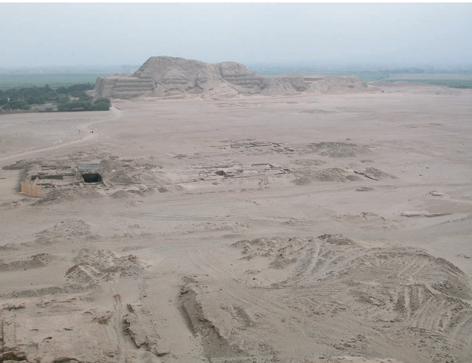
View of the Huacas de Moche site, in the lower Moche Valley, from the summit of Huaca de la Luna looking west to Huaca del Sol. The urban sector lies between the two in the valley bottom. Some excavated residential units are visible in the middle distance.