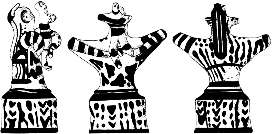
Fig 1: Figural Group from Mavrospelio. Herakleion Archaeological Museum HM 8345. Drawing from G. Rethemiotakis 1998, fig. 15a.