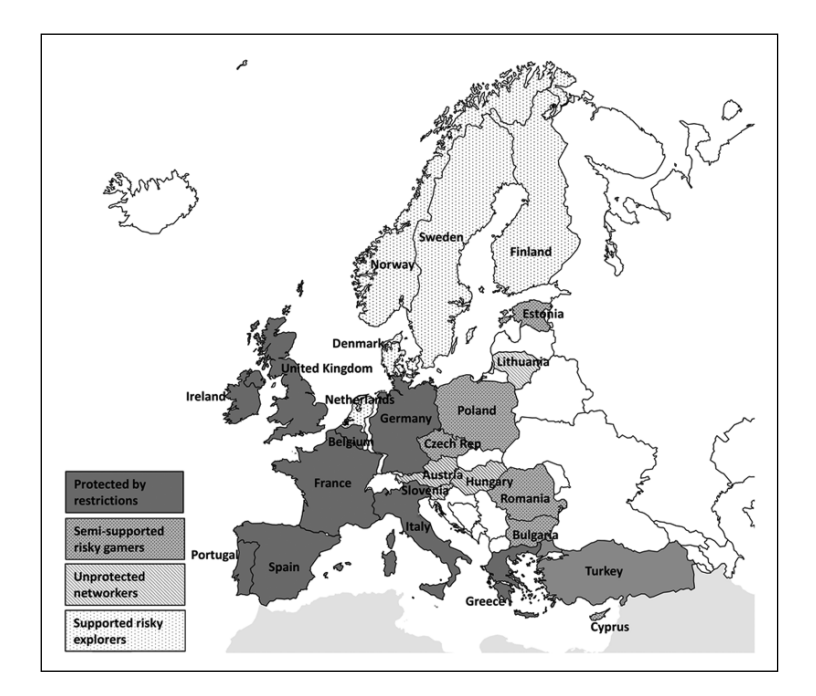
Figure 2. Mapping children's online experiences by country. Source: Helsper et al. (2013).

satisfactory explanations for differences within Europe. Somewhat ironically, it may be concluded, at a time when Internet use was spreading considerably across the globe, this distinctively cross-national study proved more successful in explaining within-country differences than between-countries differences. This may be due to the lack of comparable indicators or, more likely, to the underdevelopment of theory on which to base hypotheses and select indicators.