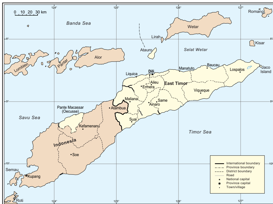
Figure B1. Map of East Timor