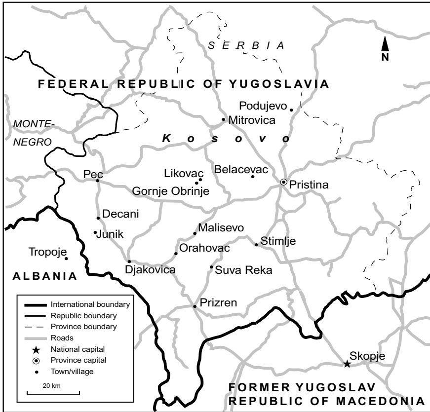
Figure B2. Map of Kosovo