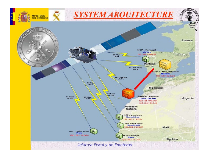
Figure 1. Depiction of Seahorse network.

them [migrants] leaving' the coastline in the first place - and the African forces' collaboration, he insisted, was key to that effort (interview, June 2010).