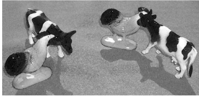
Fig. 2. A scenario acted out in the sentence-scenario matching task.

In the sentence-scenario matching task, two scenarios were presented by the experimenter, one of which matched the sentence and the other involved a reversal of the two arguments (as shown in Fig. 2). The children were asked to point at the picture or at the scenario that matched the sentence.