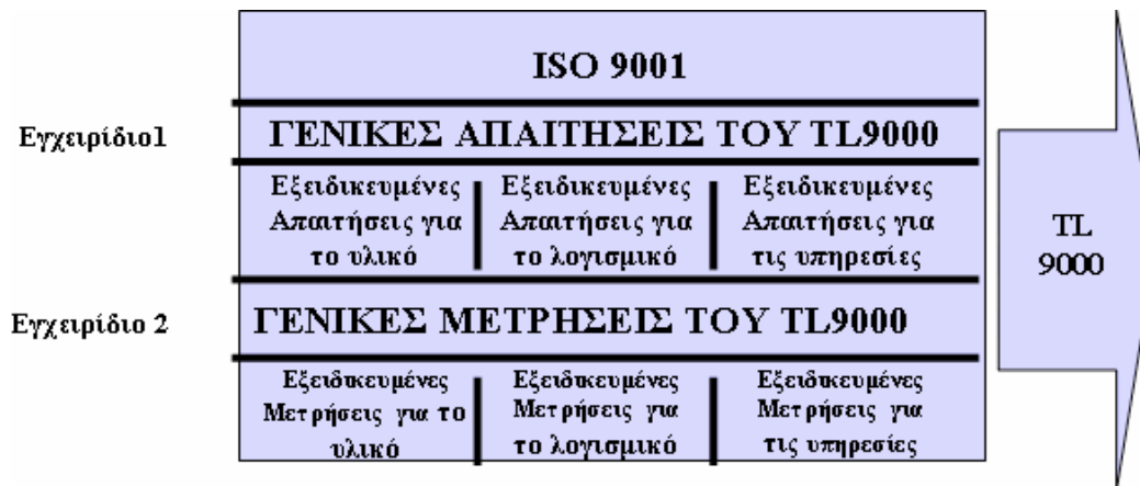
μ 3: TL 9000 ( : QuEST Forum)