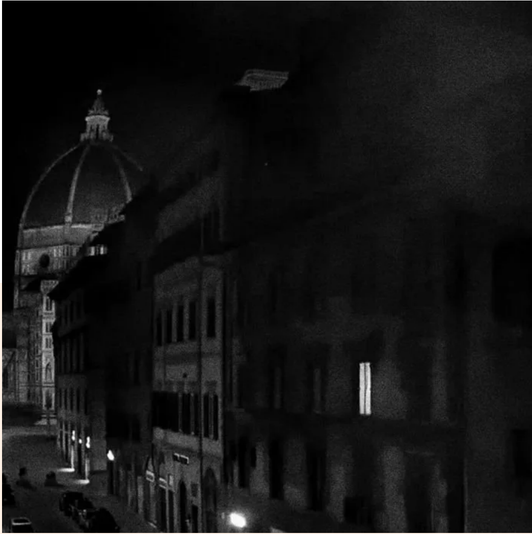
The Duomo in Florence