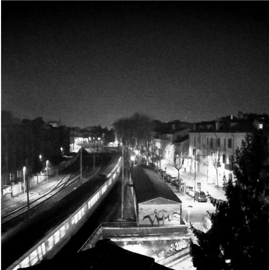
Veduta della Casa Universitaria in Lodi