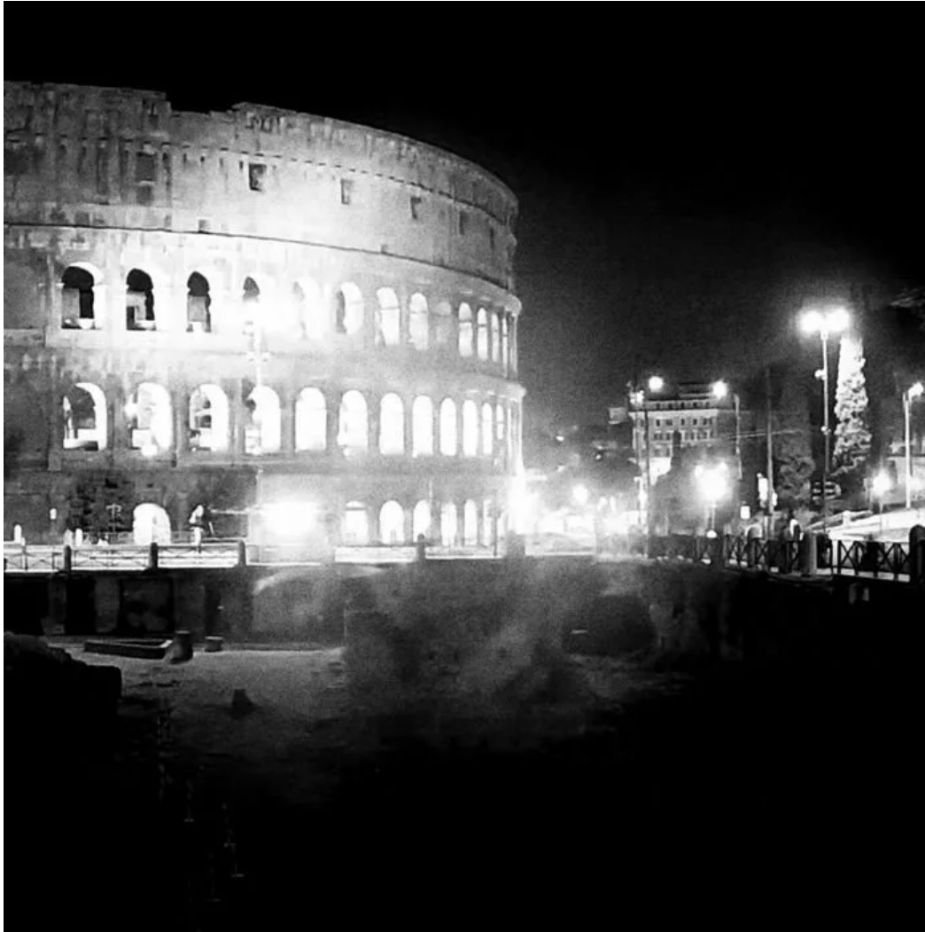
The Colosseum in Rome