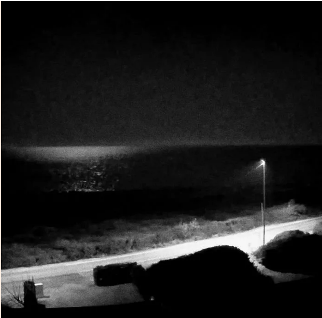
Torre San Giovanni, in Lecce

Unfortunately, at present countries hardly do any of these things. A collective paralysis has gripped the international community. There seem to be no adults in the room. One would have expected to see already weeks ago an emergency meeting of global leaders to come up with a common plan of action. The G7 leaders managed to organise a videoconference only this week, and it did not result in any such plan.