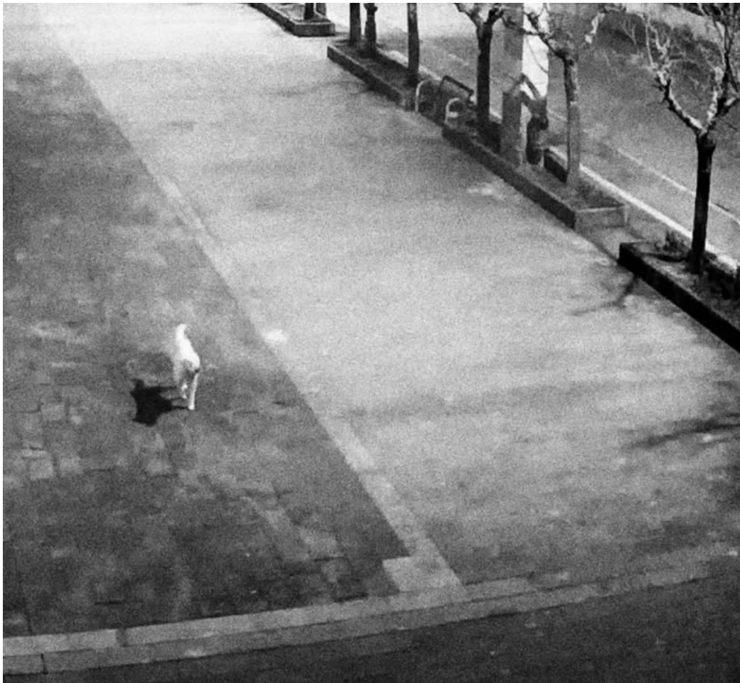
Piazza Beato Roberto in Pescara

In their battle against the coronavirus epidemic several governments have already deployed the new surveillance tools. The most notable case is China. By closely monitoring people’s smartphones, making use of hundreds of millions of face-recognising cameras, and obliging people to check and report their body temperature and medical condition, the Chinese authorities can not only quickly identify suspected coronavirus carriers, but also track their movements and identify anyone they came into contact with. A range of mobile apps warn citizens about their proximity to infected patients.