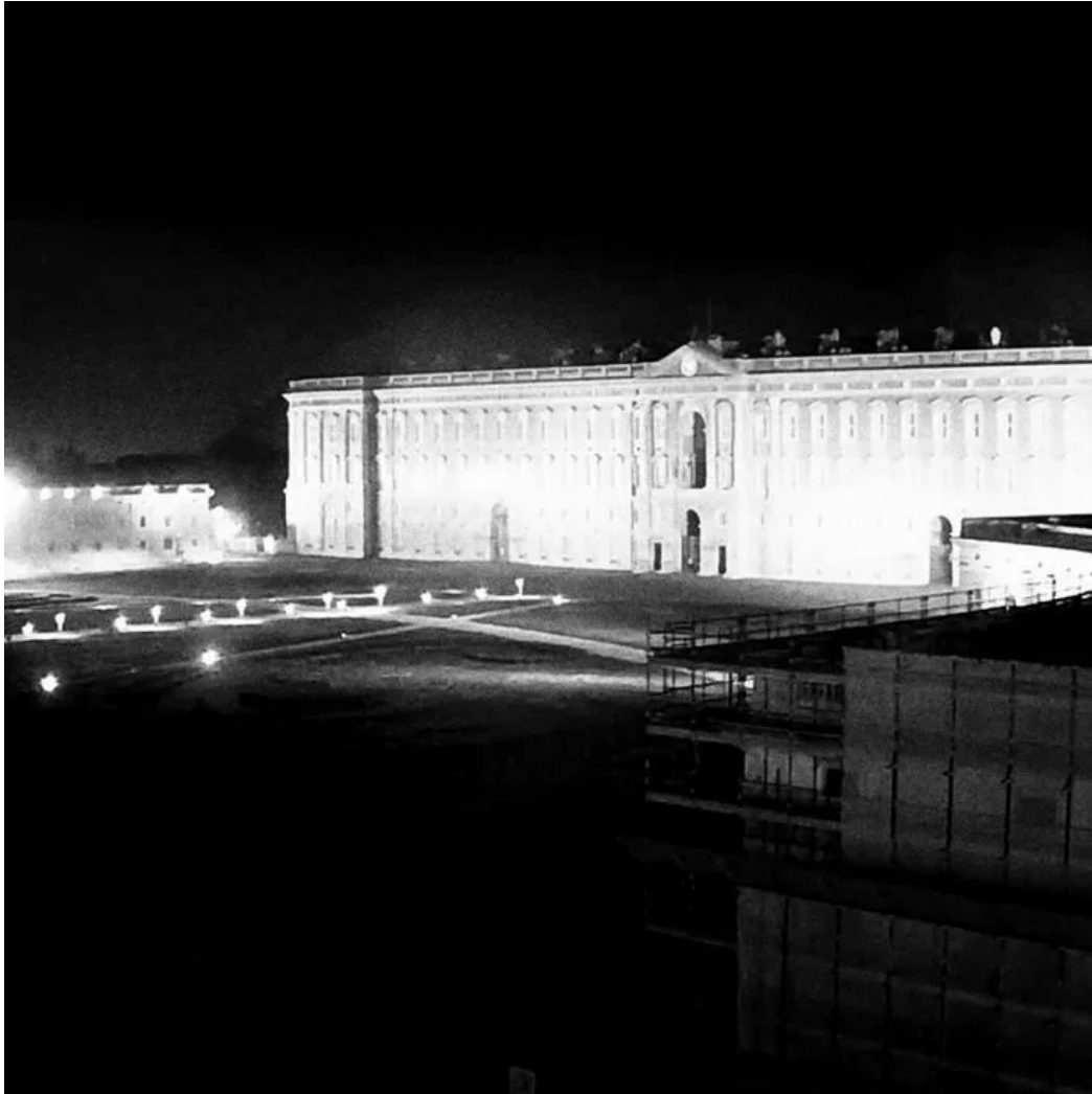
The Royal Palace of Caserta

but rather because they understand the facts. I wash my hands with soap because I have heard of viruses and bacteria, I understand that these tiny organisms cause diseases, and I know that soap can remove them.